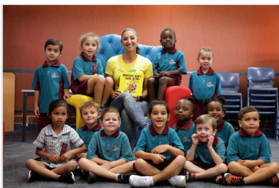
Joondalup-Wanneroo Times/Weekender April 16, 2019 - 1

Monsters don't wear ties can be brought to www.unleishedart.com .